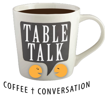
Table Talk will return in the Fall.

Mark your calendars for the return of the